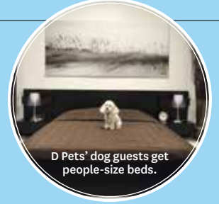
D Pets' dog guests get people-size beds.