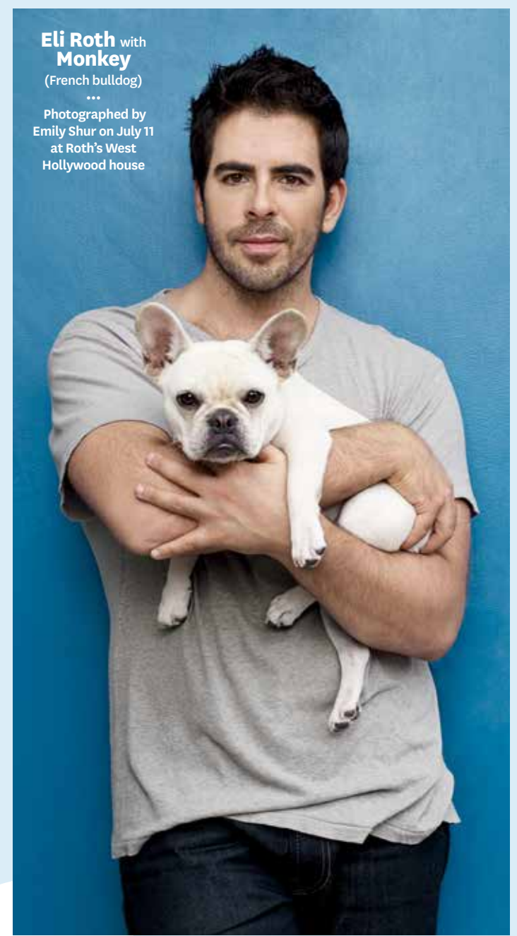
Eli Roth with Monkey (French bulldog)